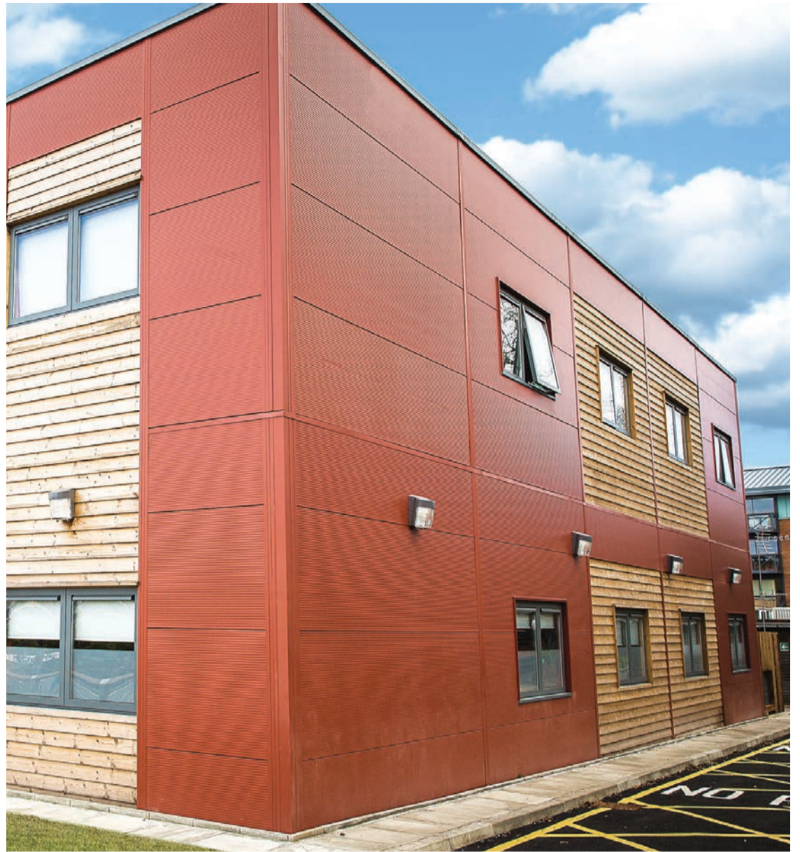
West Middlesex Maternity Unit is a current facility on long term hire with MCH

In the public sector there is often a requirement for funding solutions to be classified as being 'off balance sheet'. MCH's knowledge of accounting standards (including SSAP21, IFRS, GAAP, and IAS17), coupled with our experience in consulting with public sector auditors, ensures that we are able to consistently structure solutions which meet the relevant accounting requirements.